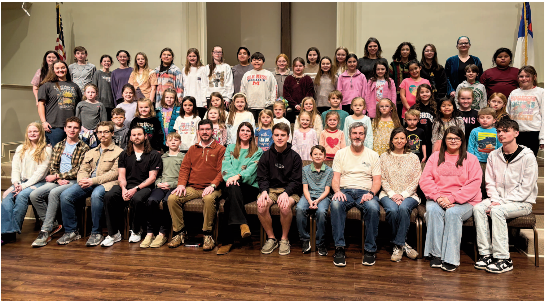
The cast of "Tarzan the Musical" is excited for their upcoming performances.