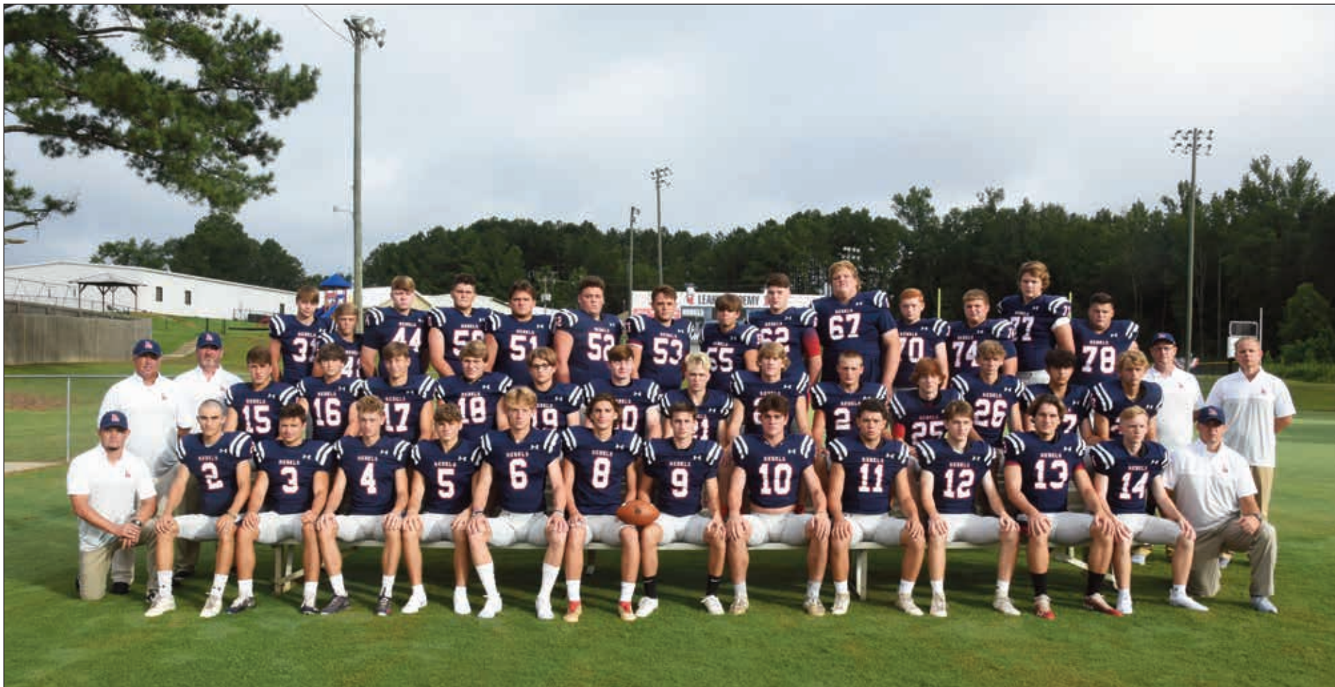
The 2020 Leake Academy football team has started off the year with two wins, including a 47-37 victory over Jackson Academy this past Friday.