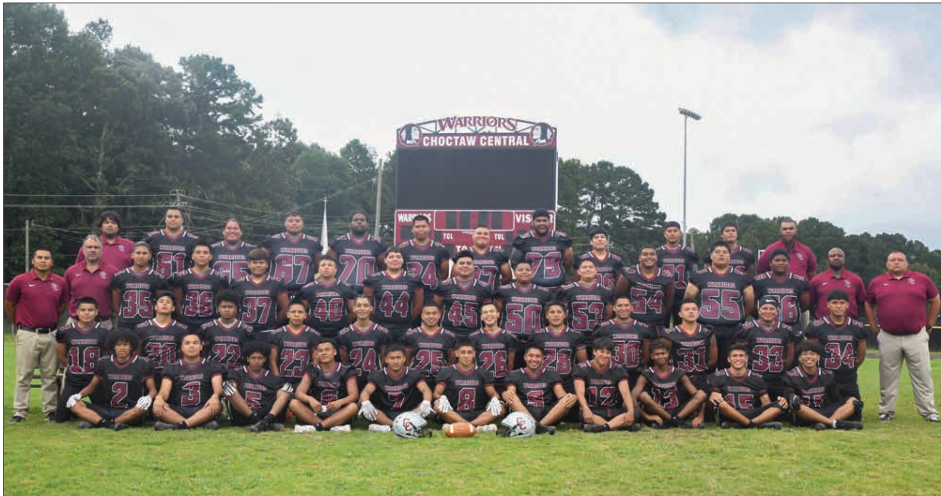
The 2020 Choctaw Central High School football team opens their season on Thursday against Nanih Waiya.